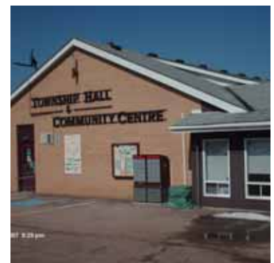
Signage is changing. Watch for our new look!