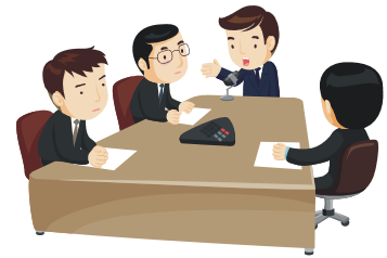
Council Meeting Dates and Times

You are always invited to attend council meetings, understanding that members of the public do not have an automatic right to speak during the meeting. Interested in running for a seat next year? Come out to a number of meetings to see what's in store or if its for you. Remaining 2013 meetings are November 8 and 22 and December 13 at 2:00 p.m.