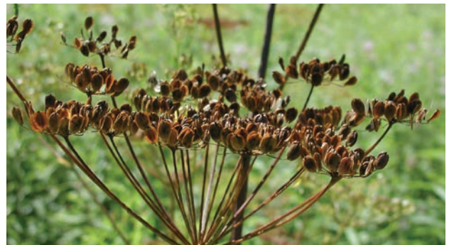
Yellowish-green flowers turn into round, flat brown seeds